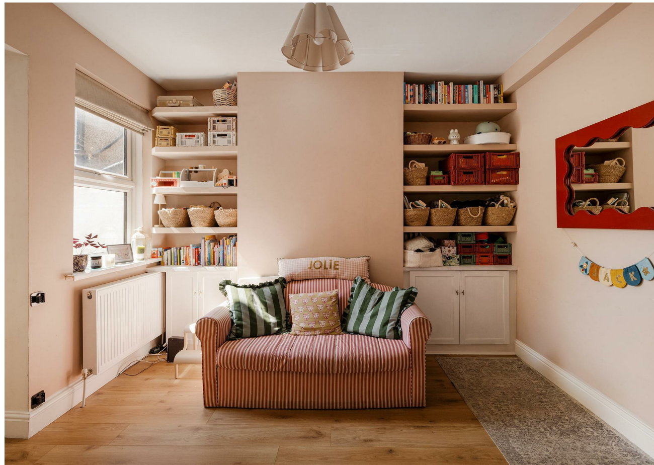
Reception Room 10'5" x 10'5"